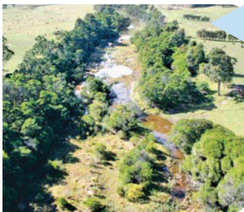
Lower Genoa River

Further information about the VWMS is available at www.depi.vic.gov.au or people can contact the Authority via phone, in person or via email.