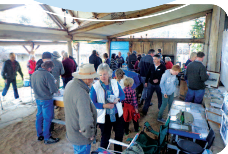
Glenaladale Landcare display

People's Choice Regional Landcare awards were made in the categories of Landcare Group, Landcare Project and Individual Landcare member.