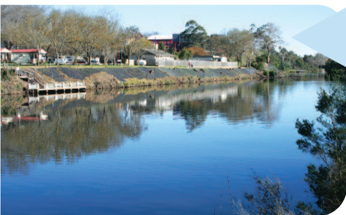
Recently planted site after removal of poplars.