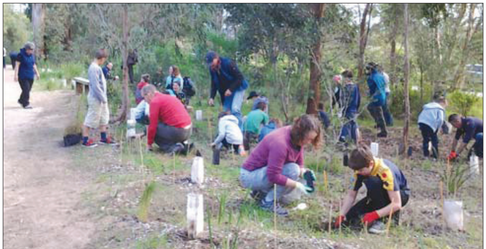
Hard-working volunteers towards the end of their productive morning. (es)